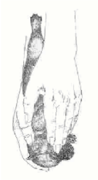
Figure # 3 Head pointed down