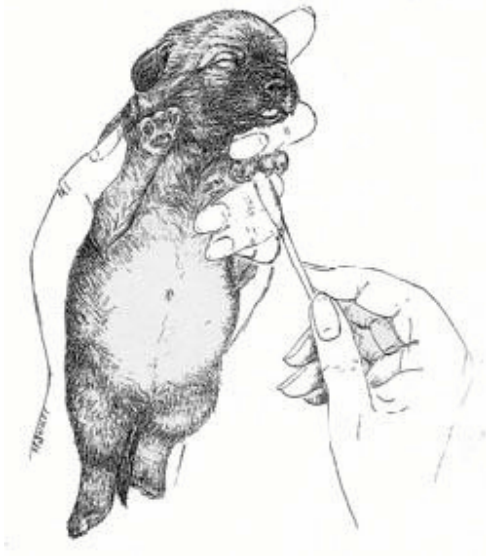
Figure # 2 Head held erect